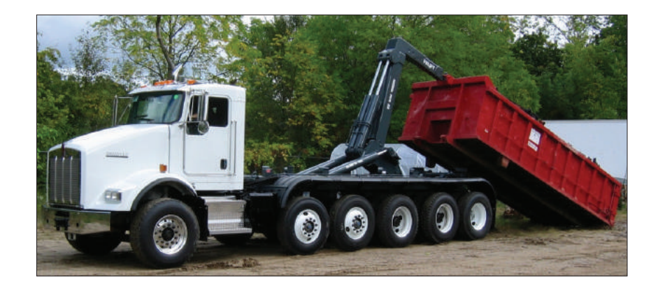
Note(*): Intended for double trailers when using maximum of 28' containers